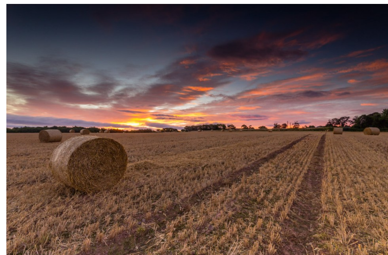
"The Time of the Season." by Jonathan Combe is licensed under CC BY 2.0.

According to the Natural Resources Conservation Service, “Conservation Technical Assistance (CTA) provides our nation’s farmers, ranchers, and forestland owners with the knowledge and tools they need to conserve, maintain and restore the natural resources on their lands and improve the health of their operations for the future.”