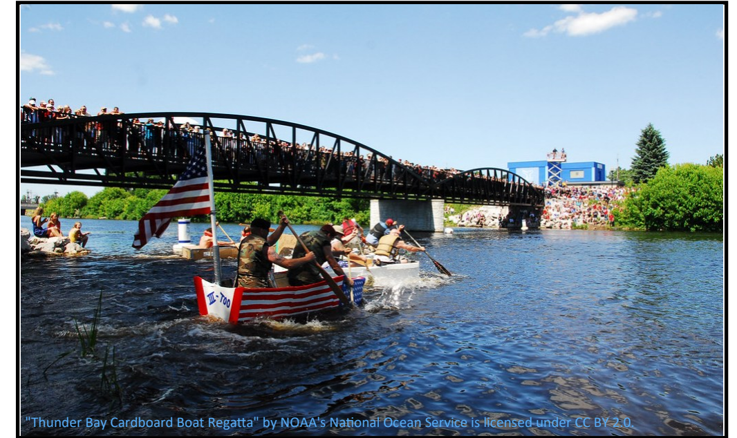
"Thunder Bay Cardboard Boat Regatta"

District Conservationist (989) 356-3596, Ext. 112